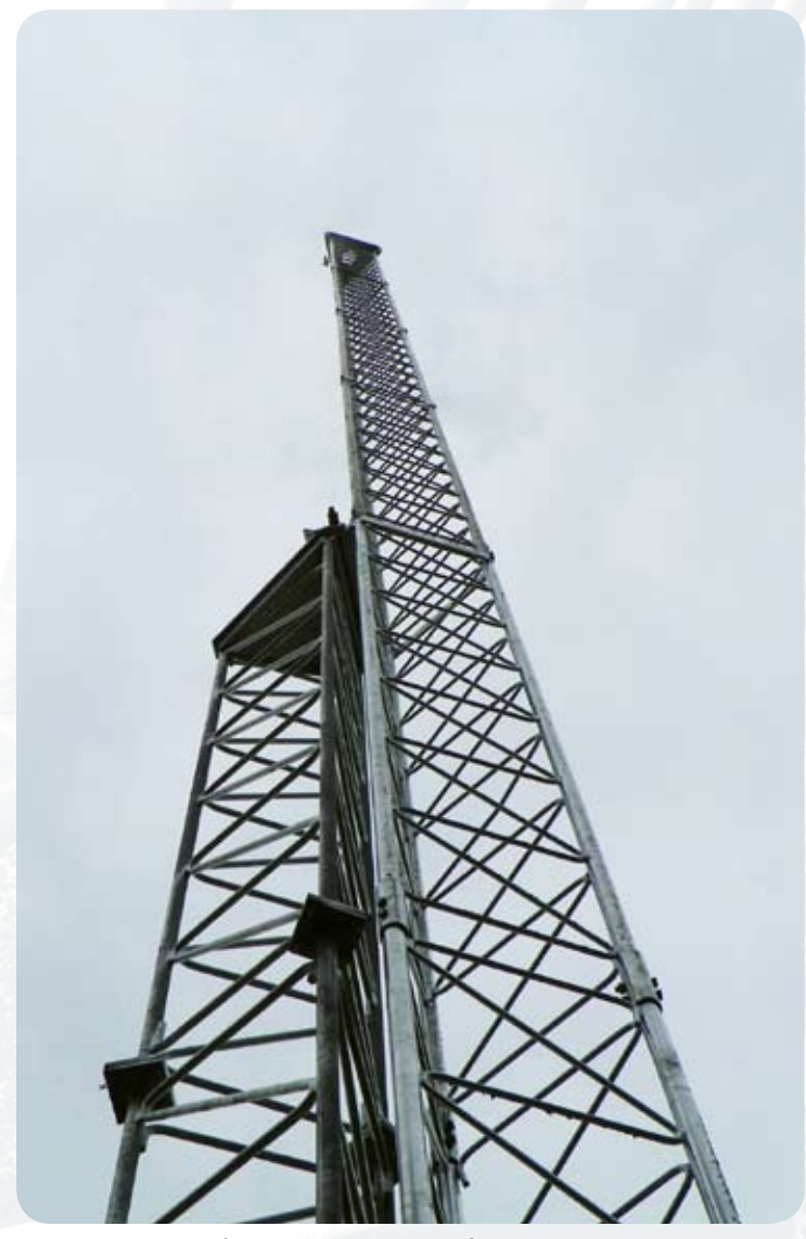
60' ROHN 55FK shown fully extended

ROHN's new design starts with a solid 45GSR base with a welded hinge at the top. A ROHN 55G tower provides the mast, extending up to 60'. The ROHN 55FK is designed to support a top load of 10 ft<sup>2</sup> EPA (Exp C, Structure class II). The design is based on 90mph winds, with no ice, and is available in several heights: 20', 30', 40' 50' and 60'.