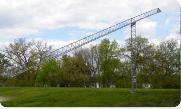
60' ROHN 55FK shown in lowered position