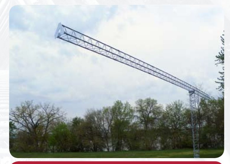
Folds quickly and easily, in a matter of minutes.